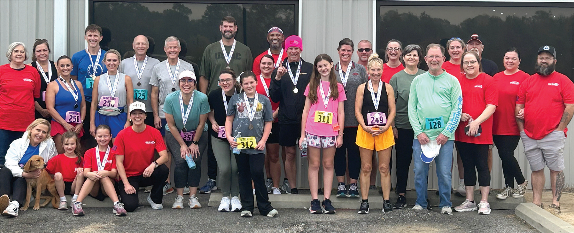
All of those who ran or walked in the 3rd Annual Veterans 5K were winners because their participation helped to raise over $1,200 for the LaSalle Parish Veterans Honor Guard, supporting the guard's mission that “no veteran is ever forgotten”.