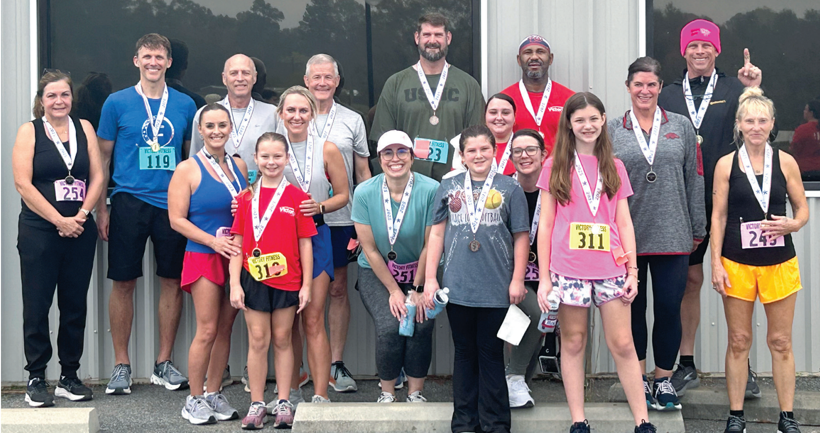
This year's winners of the Annual Veterans 5K held Saturday, November 8 in Jena are pictured with their gold, silver and bronze metals.